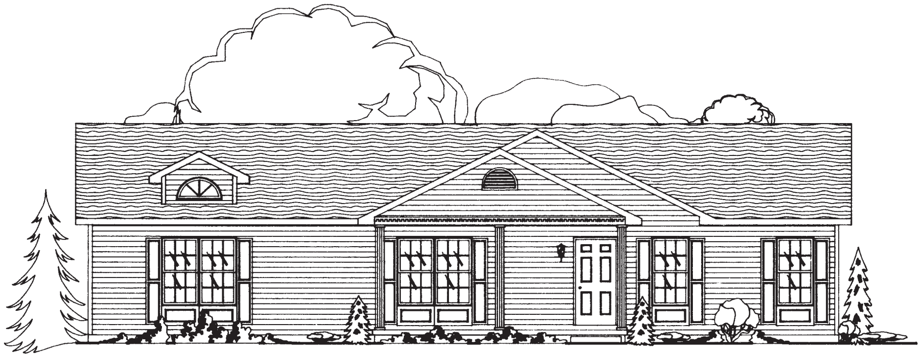
THE LEXINGTON II

2801 17th St. Marion, IL 62959 (618)998-4663